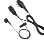
HM-166LA Light weight earphone microphone