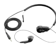
HS-97 + VS-4LA or OPC-2004LA* Throat microphone with earphone

* Either VS-4LA or OPC-2004LA is required when using HS-97 headset. VS-4LA: PTT switch cable for manual PTT operation OPC-2004LA: Plug adapter cable for VOX hands-free operation HS-94 and HS-95 also can be used with either VS-4LA or OPC-2004LA.